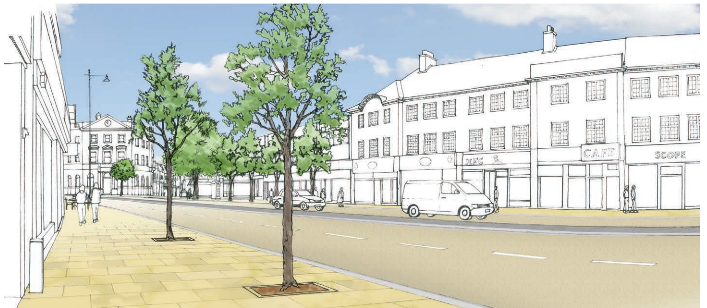
view 1 King Street north side - after