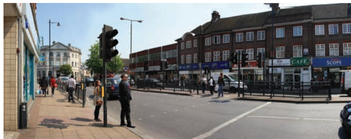
King Street north side - before